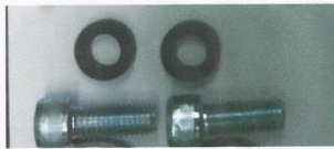
Floorboard Spacers and Bolt 2- W 1/4 OD Round 7/8 ID 1/2 2- 1/2x13x11/4 SOC Head Bolt