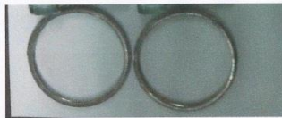
Exhaust Gaskets 2- Boarzilla Gaskets