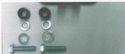
Muffer Bolts and Spacers