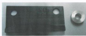
1- Trans Bracket 1- W 1/4 OD Round 3/4 ID 3/8 Spacer