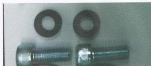
Floorboard Spacers and Bolt

1- 5/16 Flange Nut & Flat Washer & Lock Washer and 5/16 – 18x1 Hex Bolt